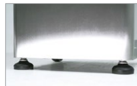
Adjustable anti-vibration feet