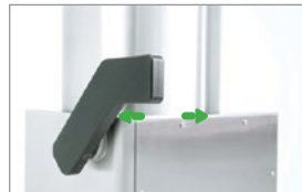
Ergonomic knee lever Reversible operating direction