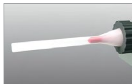
3 transparent nozzles, ø ext 14, 20 and 30 mm. Maximum hygiene, without edges