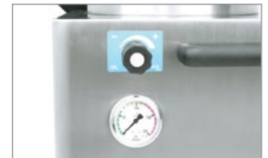
Speed control & pressure gauge