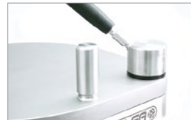
Removable lid, adjustable lid lock nuts with handles